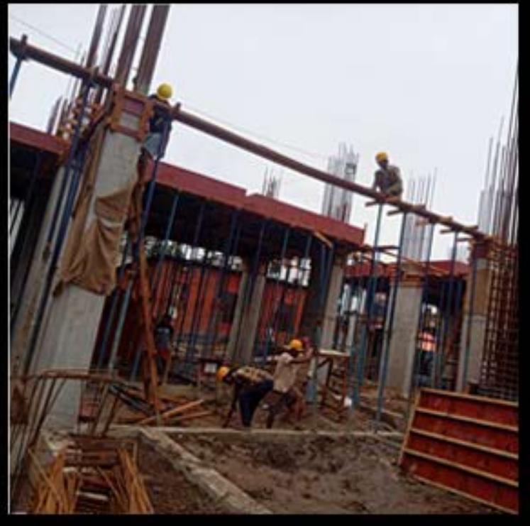
BEAM & 1ST FLOOR THUTTERING