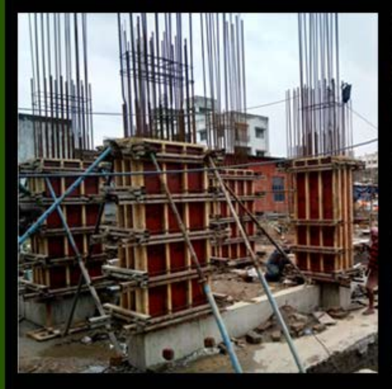
COLUMN SHUTTERING & CUSTING WORK